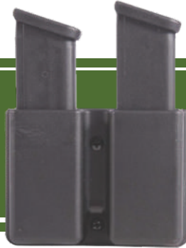
Double pistol magazine pouch