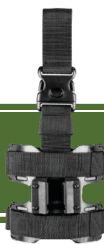
Ghost Civilian inside