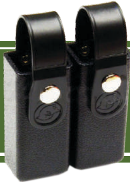
Double pouch with belt loop