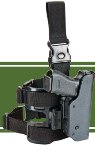
Ghost Tactical leg module